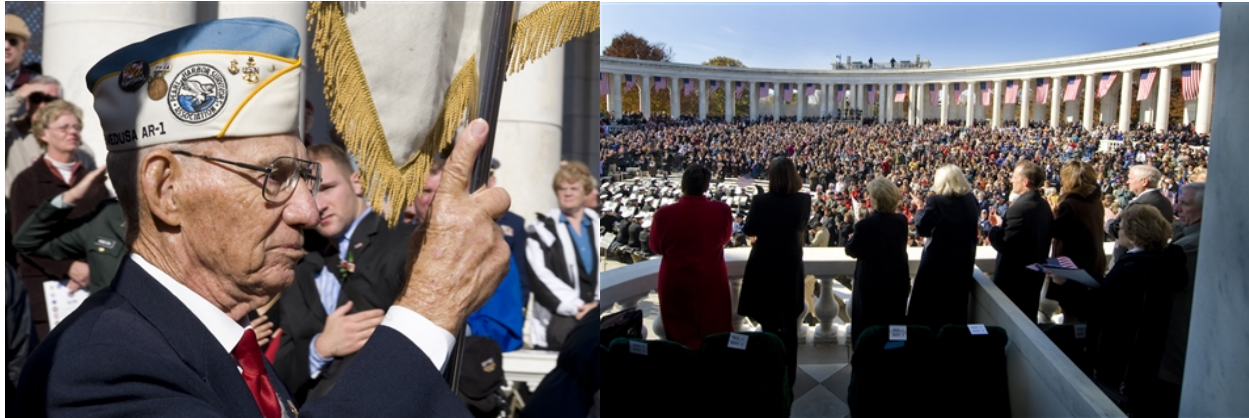
A World War II veteran carries a ceremonial flag during a Veteran's Day ceremony at the Tomb of the Unknown Soldier at Arlington National Cemetery, Nov. 11, 2008.

Please forward this newsletter to others and consider how you can make a difference for Chaplaincy by contributing to NCMAF/ECVAC through a designated offering.