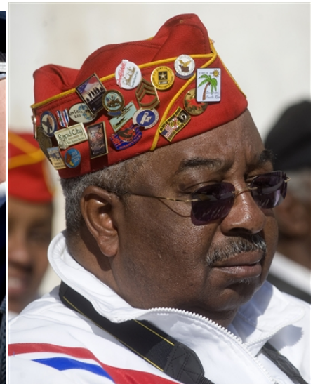
A U.S. veteran attends a Veteran's Day ceremony at the Tomb of the Unknown Soldier at Arlington National Cemetery, Nov. 11, 2008.