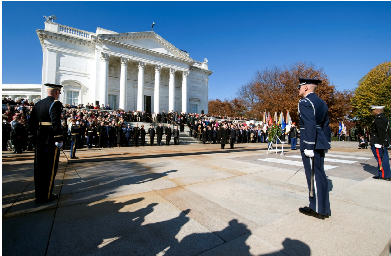
Veterans Day, 2008 at Arlington National Cemetery

Military One Source Department of Veterans Affairs National Center for PTSD – The Military Chaplain's Association The Pew Forum on Religion and Public Life Religious News Service Coalition of Spirit Filled Churches Member Groups Christian Reformed Church Resources for Soldiers J.M. Dawson Institute of Church State Studies – Baylor University Religion Clause U.S. Department of Defense – Defense Link Baptist Joint Committee for Religious Liberty The American Legion Warrior Care Religious Diversity and Accommodation (Defense Equal Opportunity Management Institute) Armed Forces Chaplains Board National VA Chaplains Center Iraq and Afghanistan Veterans of America