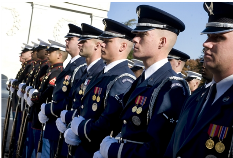
Joint Honor Guard members participate in a Veteran's Day ceremony at the Tomb of the Unknown Soldier at Arlington National Cemetery, Nov. 11, 2008.