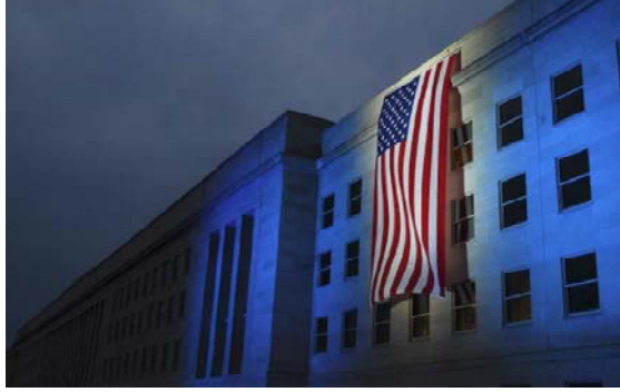
In this file photo, a memorial flag is illuminated, Sept. 11, 2007, near the spot where American Airlines Flight 77 crashed into the Pentagon.

Please forward this newsletter to others and consider how you can make a difference for Chaplaincy by contributing to NCMAF/ECVAC through a designated offering.