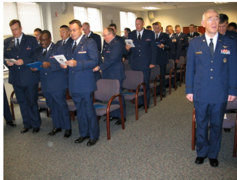
Final graduation ceremony of the Air Force Chaplain Service Institute while located at Maxwell – Gunter Air Force Base.

The CSI is home to the Chaplain Assistant Apprentice course for enlisted members, the Chaplain Candidate course for the Air Force Reserve Command, Basic and Intermediate Chaplain Courses and courses for Wing Chaplains.