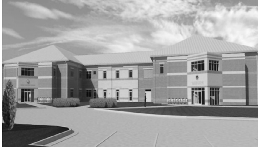
This graphic rendering depicts the building that will house the Air Force and Navy chaplain schools. In addition, the building includes a 300-seat auditorium and shared classrooms.

That’s going to happen now, so we’re excited about that,” Hedges said. “It’s going to be a good thing — coming together.”